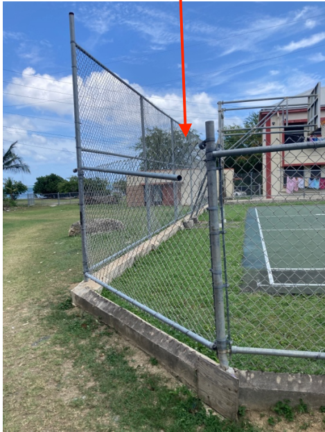
Top rail to be repaired