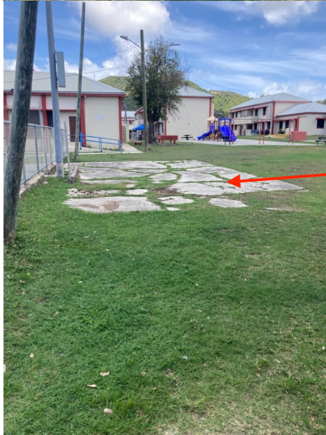
Concrete slab to be removed